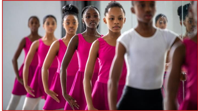
Students of the Joburg Ballet School