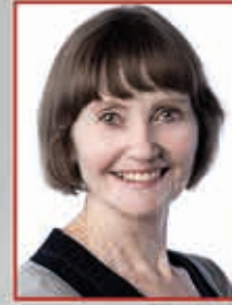
Di Sparks PR & Publicity