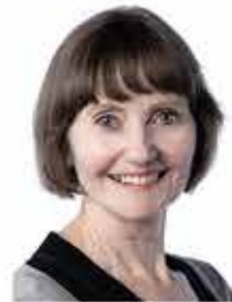
Di Sparks PR and Publicity