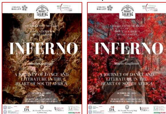
Above: Posters for Inferno

Following the success of the performance at the Market Theatre, arts administrator Ismail Mohammed requested performances of Inferno at an arts festival in Durban in 2022 while the Italian Cultural Institute requested a tour of the production to Cape Town.