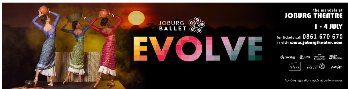
Evolve billboard with image from Legae

Six performances of Evolve were scheduled for the Joburg Theatre from 1 to 4 July but cases of Covid-19 in the company required that all the dancers be sent home for fourteen days. Consequently Evolve was postponed to 5 to 8 August 2021.