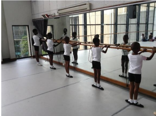
Above: Students of the Joburg Ballet School

Eventually both the satellite schools and Joburg Ballet School returned to their venues at the beginning of September but due to the pandemic there were no exams except for the few students who were ready, and instead of a Showcase at the end of the year, a showing of the assessments in the downstairs studio was planned for November.